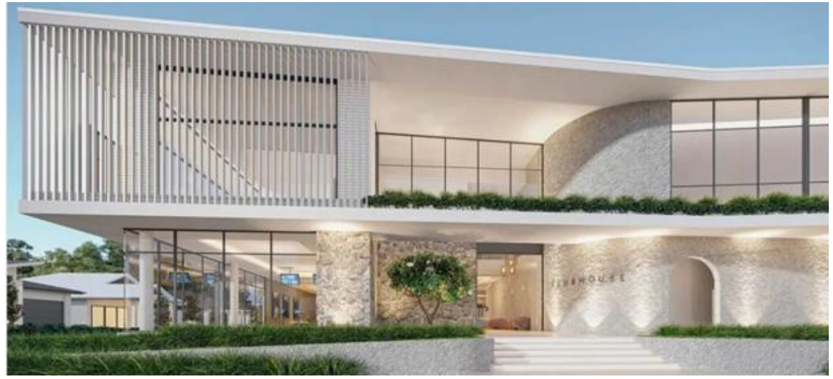
Progress is continuing.

The clubhouse is still on track to be completed by the second quarter of 2024; however, handover is now expected in July 2024.